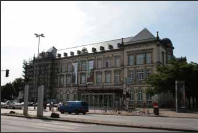
Museum für Kunst und Gewerbe Hamburg 299 objects (2,719 images)