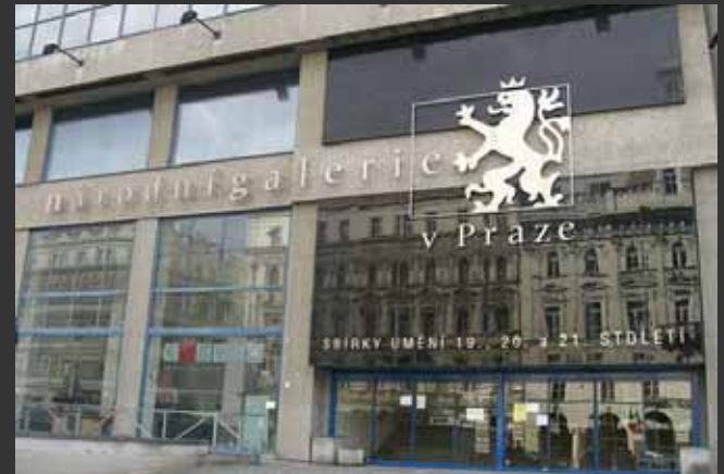
Národní galerie v Praze 51 objects (291 images)