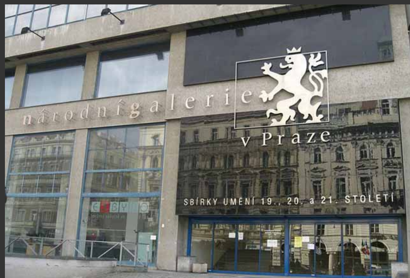
Národní galerie v Praze