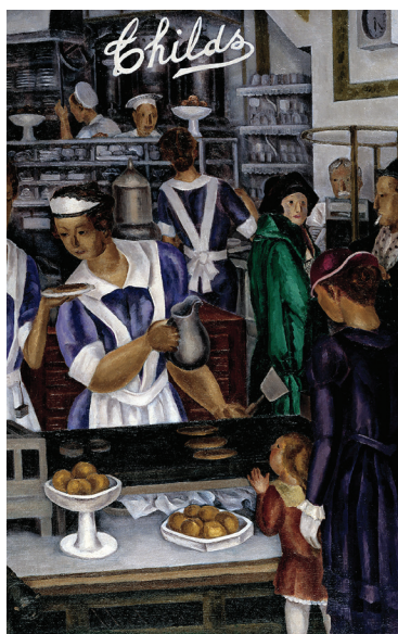
Toshi Shimizu, Childs, 1924.