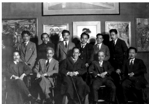
A Group Photograph taken at a Japanese exhibition in 1927.

The digital exhibition, Japanese Artists in New York City, Artistic Traces from the 1910s to the 1940s , reveals the life of Japanese artists, their artwork, and the historical context in which their works were created. Through in-depth research of newspapers, magazines and other print media of the period, the exhibit showcases the vibrant creative activities of Japanese living in New York as artists. In particular, the diverse perspectives regarding their work by local communities as seen through exhibition catalogs, media and illustrated books of various exhibitions will be discussed. Diligently researched by guest curator Mai Sato, this is the first exhibition of its kind to present articles originally written in Japanese and translated into English.