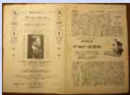
'Aoi kwan program, 1919

There are collected by various prefecture