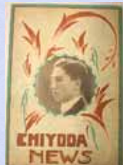
'Chiyoda News, 1925

立命館大学国際平和ミュージアム所蔵映画プログラムデータベース http://www.dh-jac.net/db6/eiga-program/heiwhp/kyoshi01.htm