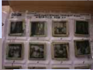
Slides for lantern "Chusingura 忠臣蔵" (1921 and 1926?, Nikkatsu)