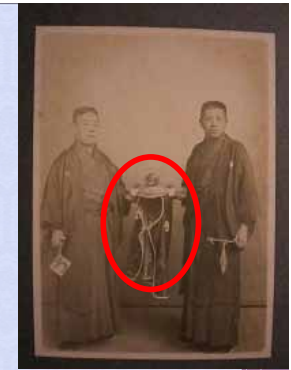
Photo in album

At least, 3 slides for lantern's contents was "Jitsuroku Chusingura/実録忠臣蔵" made in 1920 by Nikkatsu/日活