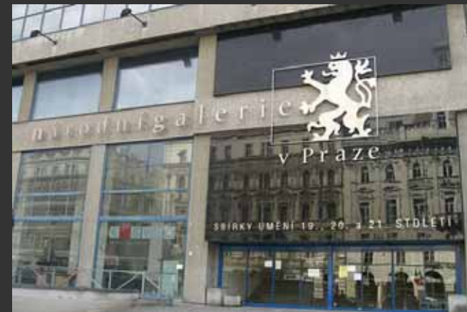
Národní galerie v Praze 51 objects (291 images)