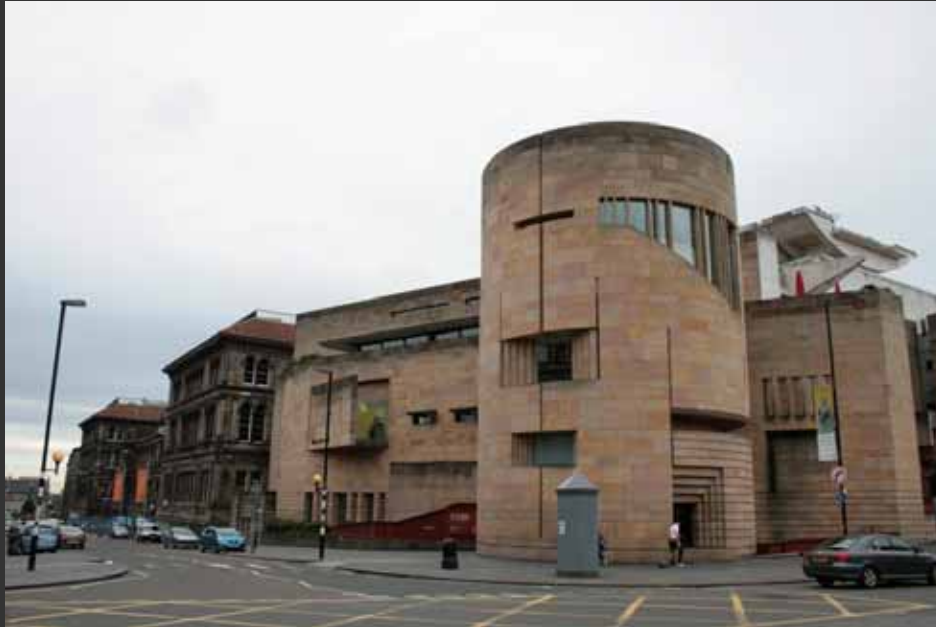
National Museums Scotland, Edinburgh