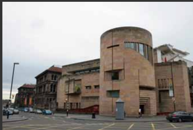
National Museums Scotland 280 objects (2,511 images)