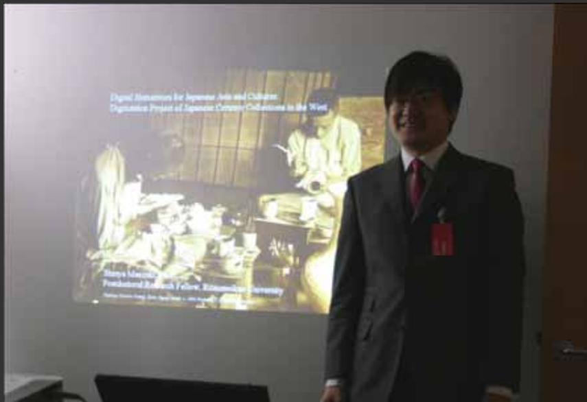
‘Digital Humanities for Japanese Arts and Cultures: Digitization Project of Japanese Ceramic Collections in the West’