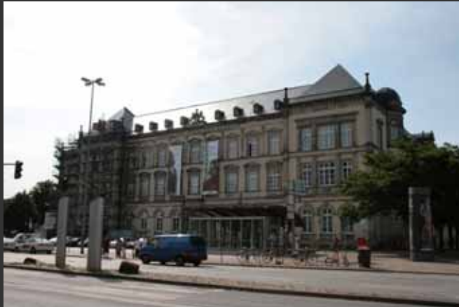
Museum für Kunst und Gewerbe Hamburg 299 objects (2,719 images)