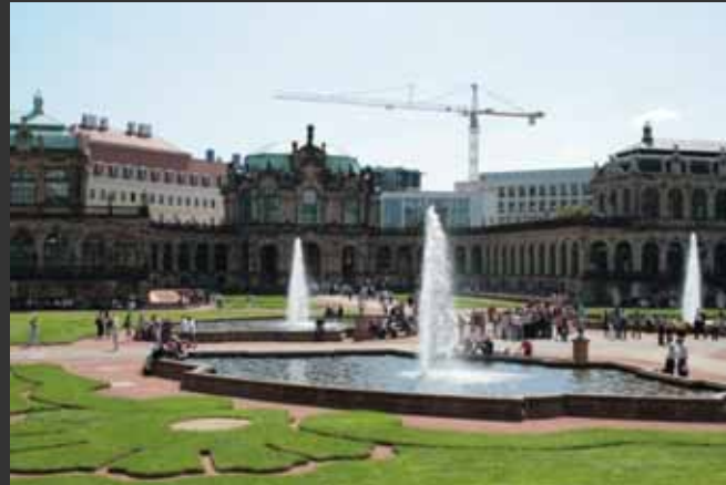
Staatliche Kunstsammlungen Dresden – Porzellansammlung 225 objects (2,330 images)