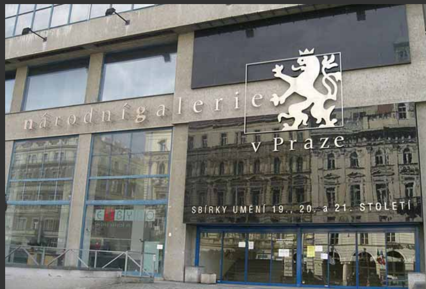
Národní galerie v Praze