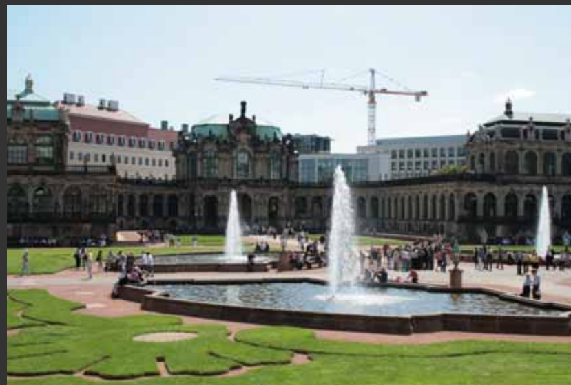
Staatliche Kunstsammlungen Dresden – Porzellansammlung