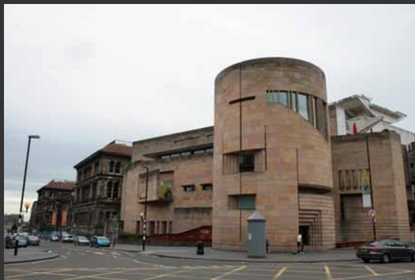
National Museums Scotland