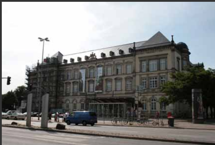
Museum für Kunst und Gewerbe Hamburg