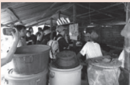
Financial Aid for Development of a Learning Community (Extracurricular Activities) eligible program: SDGs Practical Program in Laos (Agricultural site visit and interviews)