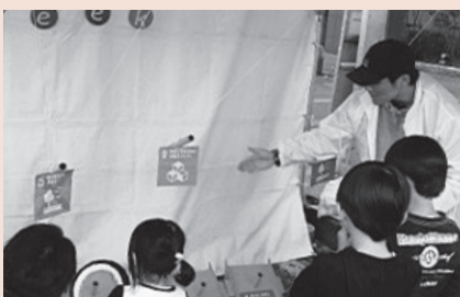
Ritsumeikan University Sustainable Week Executive Committee, recipient of the AY 2018 Financial Aid for Development of a Learning Community, holds "On The Road! Sustainable Week" event