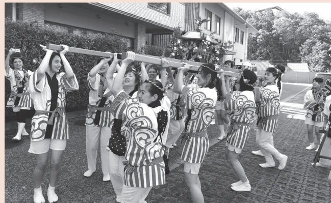
The AVA (Athlete Volunteer Association), recipient of the AY 2018 Financial Aid for Development of a Learning Community, assists with a festival at the Haradani Benzaiten Shrine