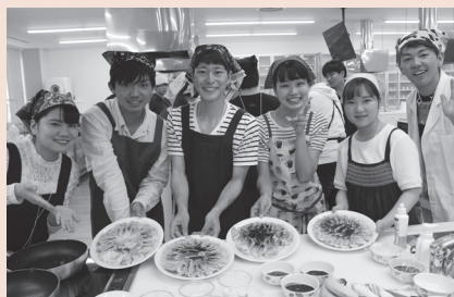
College of Gastronomy Oritor group activity: "Yummy!!!" welcome event for new students