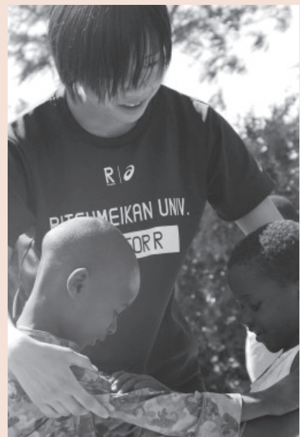
STROPS, recipient of the AY 2018 Financial Aid for Development of a Learning Community, conducts activities on the theme of "physical education volunteering at elementary schools in the poverty belt of Nanyuki, Kenya."