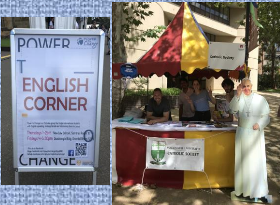
Political and religious groups are actively recruiting on campus, sometimes with specifically tailored programs for international students (University of Sydney; Macquarie University)