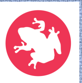
External organizations: "We have seen a shift from more alcohol-related issues towards other challenges like isolation and loneliness. In many residences, our teams are focusing more heavily on student engagement and coming up with more creative event ideas to entice international students to interact with peers" (Staff, Red Frogs Australia)