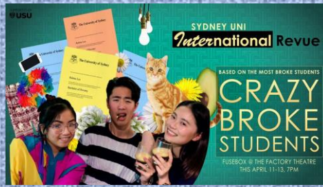
International Revue brings international and domestic students together on the stage (University of Sydney)