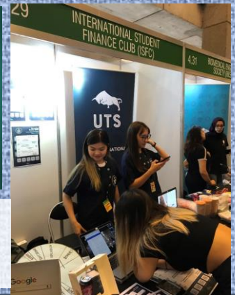
Career-oriented societies for international students University of Technology Sydney (UTS)