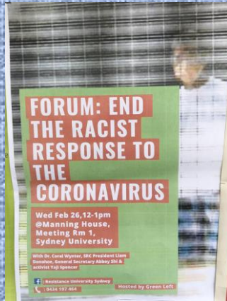
Collaboration between on-campus student groups and external political parties (Resistance University Sydney, Socialist Alliance, Green Left)