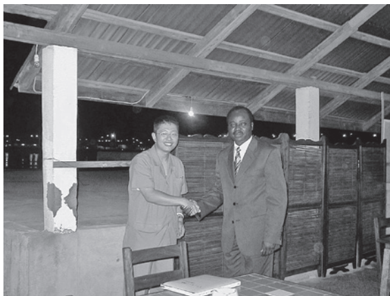
Figure 2: Interview with the Mayor of Abomey