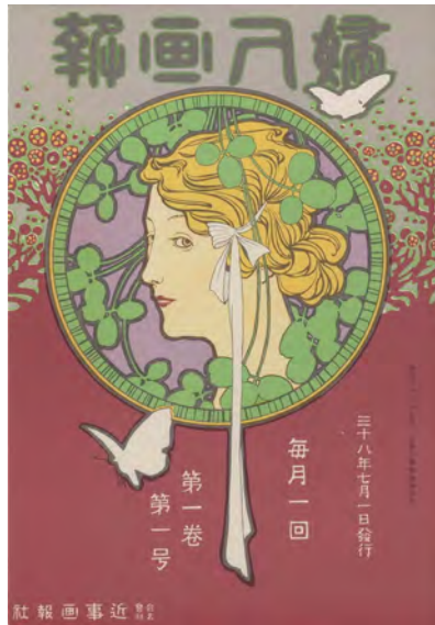
Figure 1: The first issue of the magazine Fujin Gabō (Illustrated Women's Gazette), published in 1905. The work shows a clear influence of European art movements such as Art Nouveau.

A notable development was the decision by several Japanese designers and artists to study at the Bauhaus (1919-1933), a leading design school and movement that influenced design education worldwide, including in Japan. 6 After the Bauhaus closed under increasing Nazi pressure, these designers returned to a Japan marked by rising nationalism and imperial expansion, which ultimately led to conflict in the Asia-Pacific. During this era, many Japanese designers — including Iwao Yamawaki (1898-1987), Michiko Yamawaki (1910-2000), and Yusaku Kamekura (1915-1997) — were involved in producing state propaganda. 7 Japanese design at this time combined traditional motifs with the modernist aesthetic associated with the Bauhaus (Figure 2).