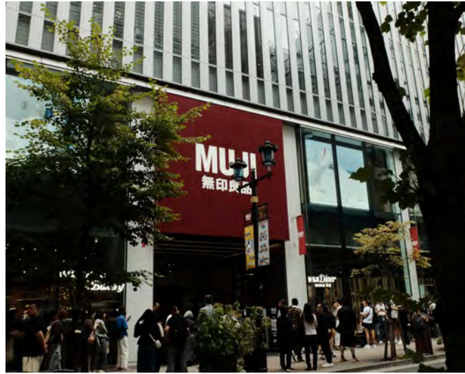
Figure 4: By the 1990s, MUJI's branding, despite the company's name literally meaning "no brand," was internationally recognized.