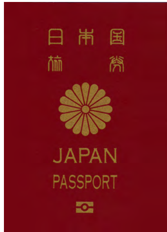
Figure 6: The Japanese passport, which features the Chrysanthemum Crest ( kikumon ) of the Japanese imperial family. 19

personal signature stamps were adopted in Japan from China around the seventh century, and their graphic form continues to influence mark-making in Japanese design (Figure 7). 20