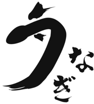
Figure 8: Example logo saying eel ( unagi in Japanese) where the first character is elongated and made to look like an eel. This is a common logo motif for restaurants specializing in eel.

Japanese typography occupies a central place in the country's design identity. It's not unusual to see Japanese characters combined in interesting and novel ways. The structure of these characters lends itself well to being joined through strokes, creating logo marks in creative ways.