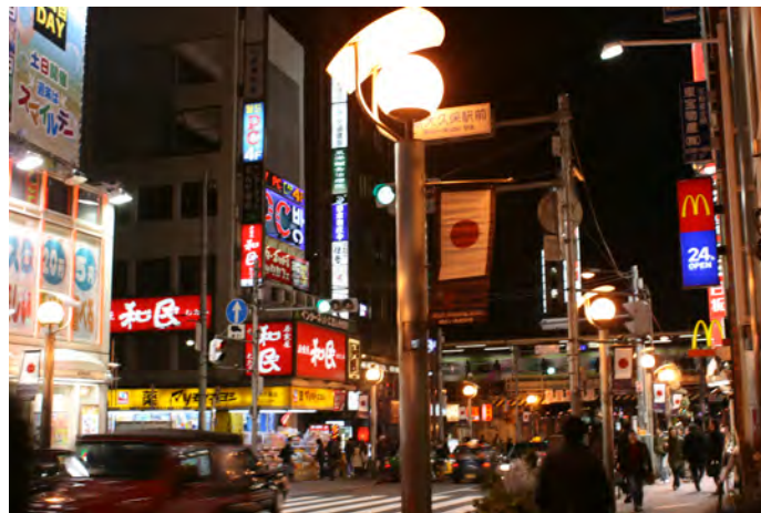
Figure 5: The Shin-Ōkubo neighbourhood in Shinjuku, Tokyo.