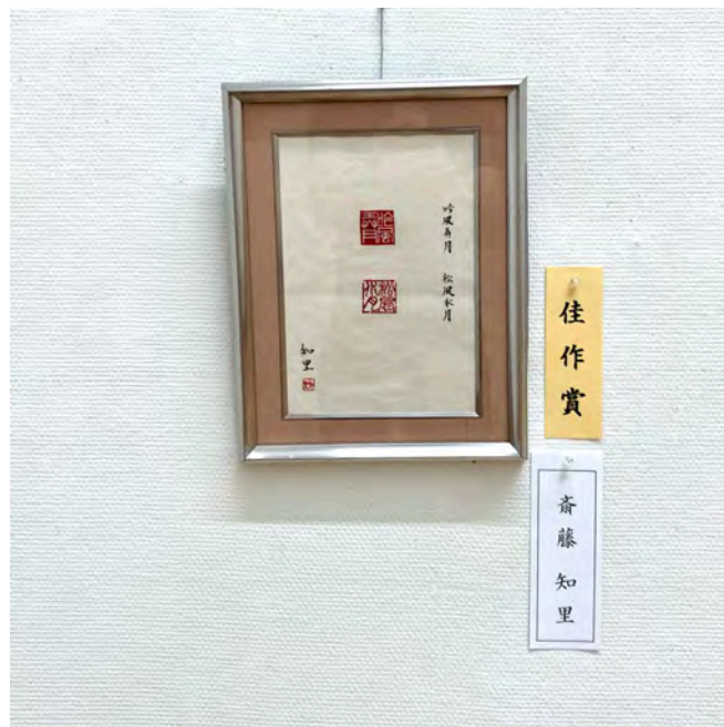
Figure 7: Inkan design by Chisato Sato, 2023.

personal signature stamps were adopted in Japan from China around the seventh century, and their graphic form continues to influence mark-making in Japanese design (Figure 7). 20