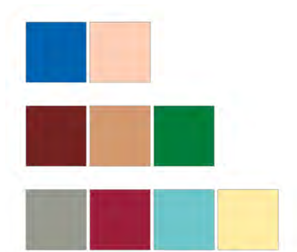
Figure 11: Colour combination samples drawn from Wada, originally presented in sets of two, three, and four colours with CMYK values (converted here to hexadecimal). Examples include a two-colour pairing of blue (#0063b0) and seashell pink (#fdceb5); a three-colour combination of pale burnt lake (#752323), ochraceous salmon (#d2996f), and diamine green (#007d3b); and a four-colour grouping of warm grey (#97998f), red (#9d1f3c), calamine blue (#6dc6ca), and pale lemon yellow (#ffeca4).

from cultural traditions, the influence of the writing system and traditional practices on typography, and the distinct evolution of Japanese colour theory compared to Western approaches.